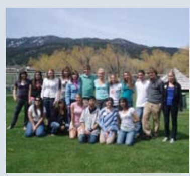
Montana Youth Exchange Students